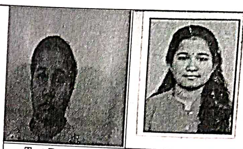
Test Day Photo Uploaded Photo

Town/City : Zahirabad District : Medak State : Telangana Email : shivanigosula13@gmail.com