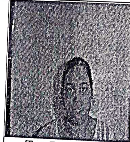
Test Day Photo

Candidate's Contact Details : Plot no 94 Flat no 406 Mahalakshmi Towers Near Shankara Matham Moti Nagar