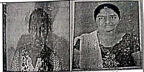
Test Day Photo