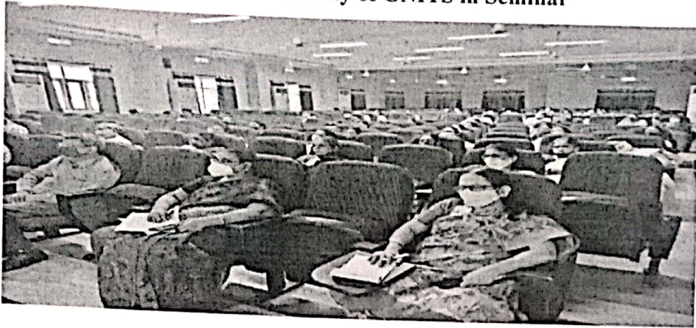
Faculty of GNITS in Seminar

Total 136 faculty from all departments of GNITS Attended the seminar with great Enthusiasm. The list is mentioned below.