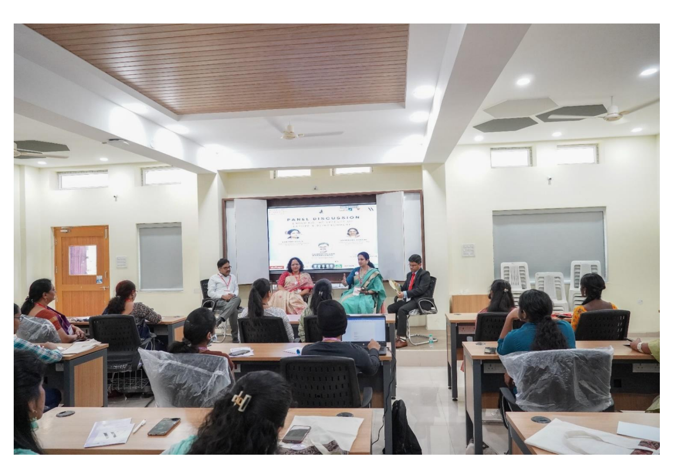
Fig 1: PANEL DISCUSSION 1- Enduring the Effects of Layoff & Retrenchment

The participants are awarded certificates for their efforts and active participation in the women in business.