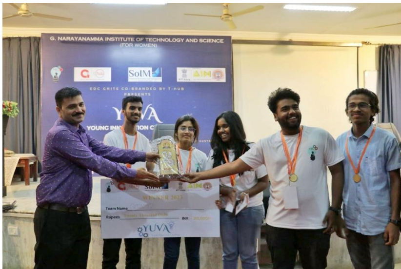
Fig 6: Winners receiving Cash Prizes, Medals, and Mementos