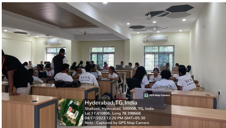
Fig 4, 5: Students working on their ideas