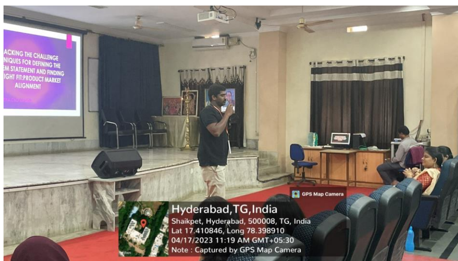
Fig 2, 3: Students and Mentor interactive session