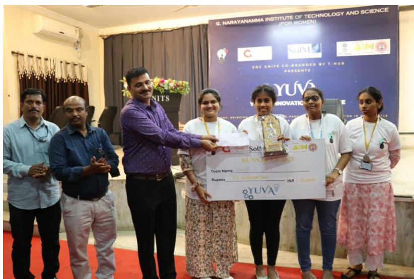
Fig 7: Runner-up receiving Cash Prizes, Medals, and Mementos