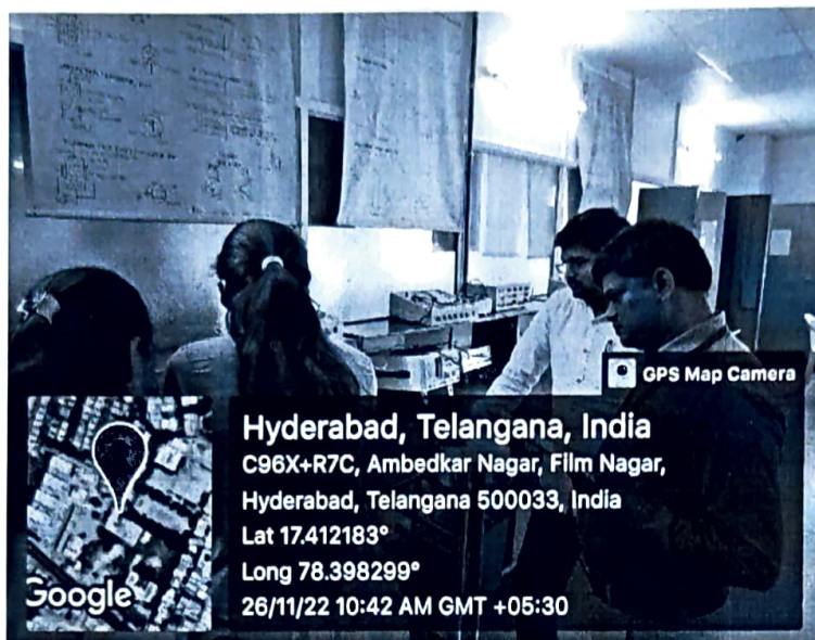
Students presenting project in the Project Expo event