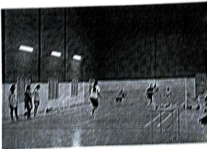
Students practicing in coaching camp in the badminton court.