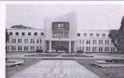
For any queries regarding the FDP, please contact:

Warangal is the second largest city of the new state of Telangana. It is situated at a distance of 140 km from the state capital Hyderabad (Nearest Airport). It is well connected by Rail (Kazipet Junction is two km away and Warangal Station is 12 km away) and by Road (NH 202). Warangal is renowned for its rich historical and cultural heritage. It was the seat of erstwhile Kakatiya dynasty. It is a seat of numerous monuments with a number of historical monuments like Thousand Pillar Temple, Fort, Bhadrakali Temple, Ramappa Temple and Laknavaram Lake located in a radius of 30 kms.