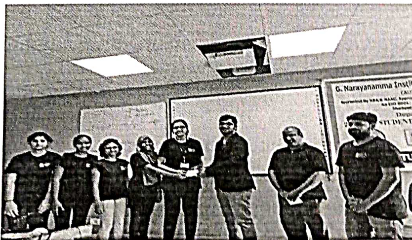
Winners receiving prize by Brain-o-Vision team and HOD

After the completion of all the phases, the two best performing teams are selected. The winning teams are rewarded with cash prizes.