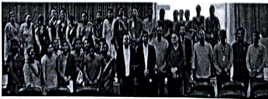
Photo2: Organizing team with participants