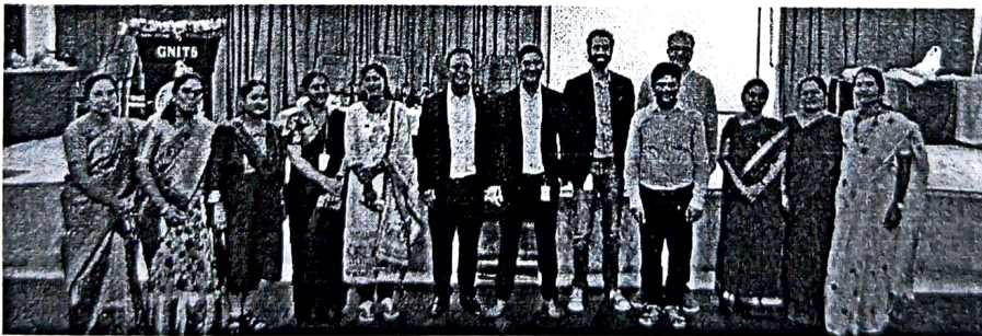
Photo1: Organizing team with Resource persons