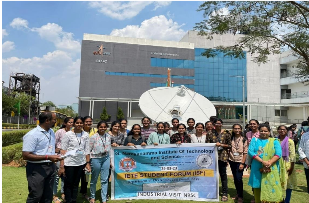
Fig 5.1: Batch-1 Students and Faculty coordinators at NRSC