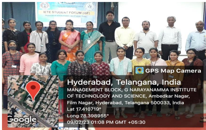
Fig 3: Participants with faculty members and Resource members