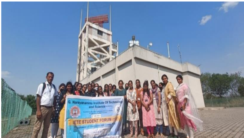
Fig 4.2: Batch-2 Students with Faculty members at radar station