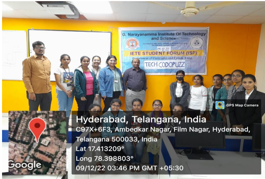
Fig 2: Participants with ECE HOD, Faculty member at Tech Codopuzz event.