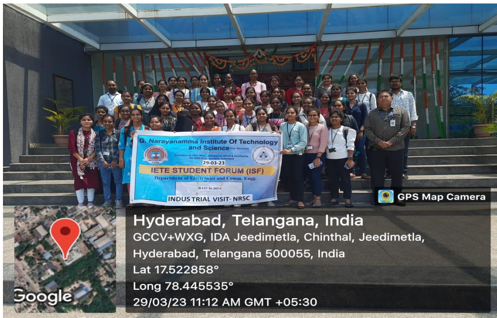
Fig 5.2: Batch-2 students and Faculty Coordinators with Speaker at entrance of NRSC